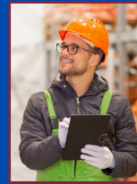
Story of Hope