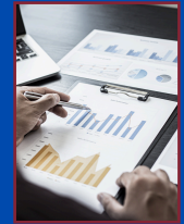
Annual Report Totals

Celebrating 50 Years of Serving God's People