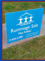
2025 Rummage Schedule